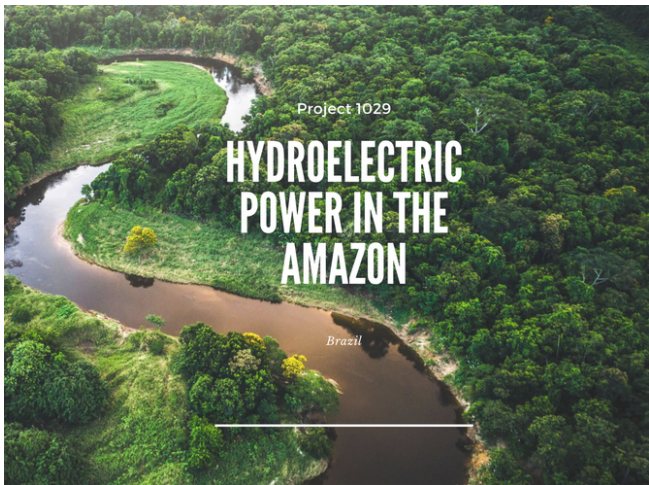
Project 1029: Hydroelectric Power in Brazil

An example of some of the projects supported include: