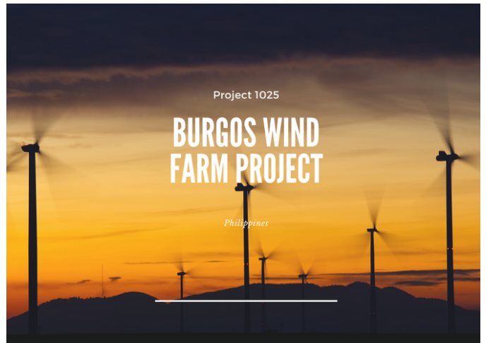
Project 1025: Wind Power in the Philippines