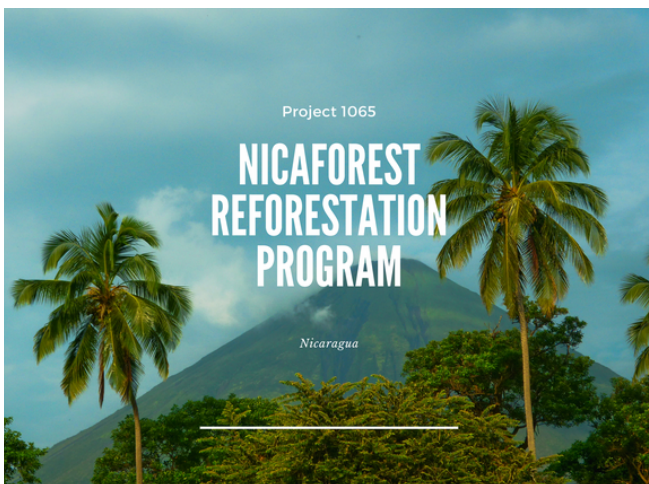
Project 1065: Reforestation in Nicaragua