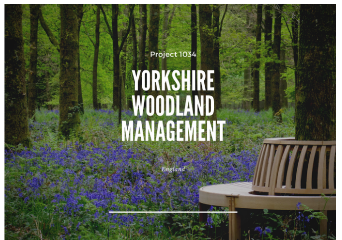
Project 1034: Woodland Management in England